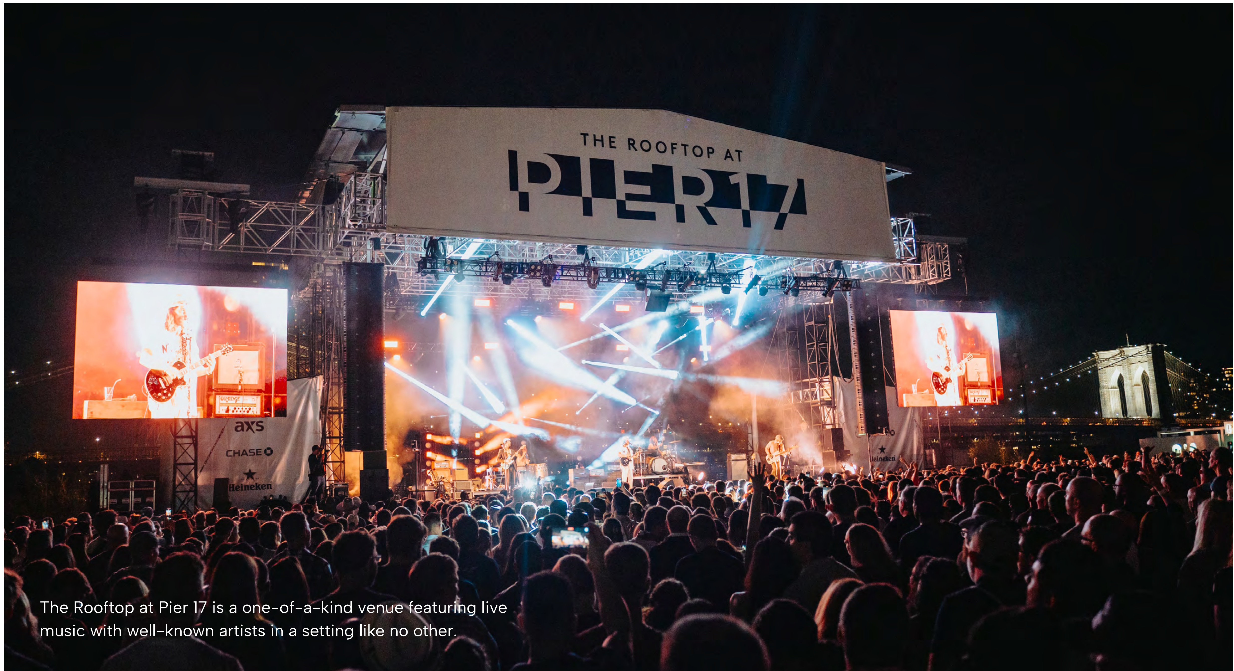
The Rooftop at Pier 17 is a one-of-a-kind venue featuring live music with well-known artists in a setting like no other.