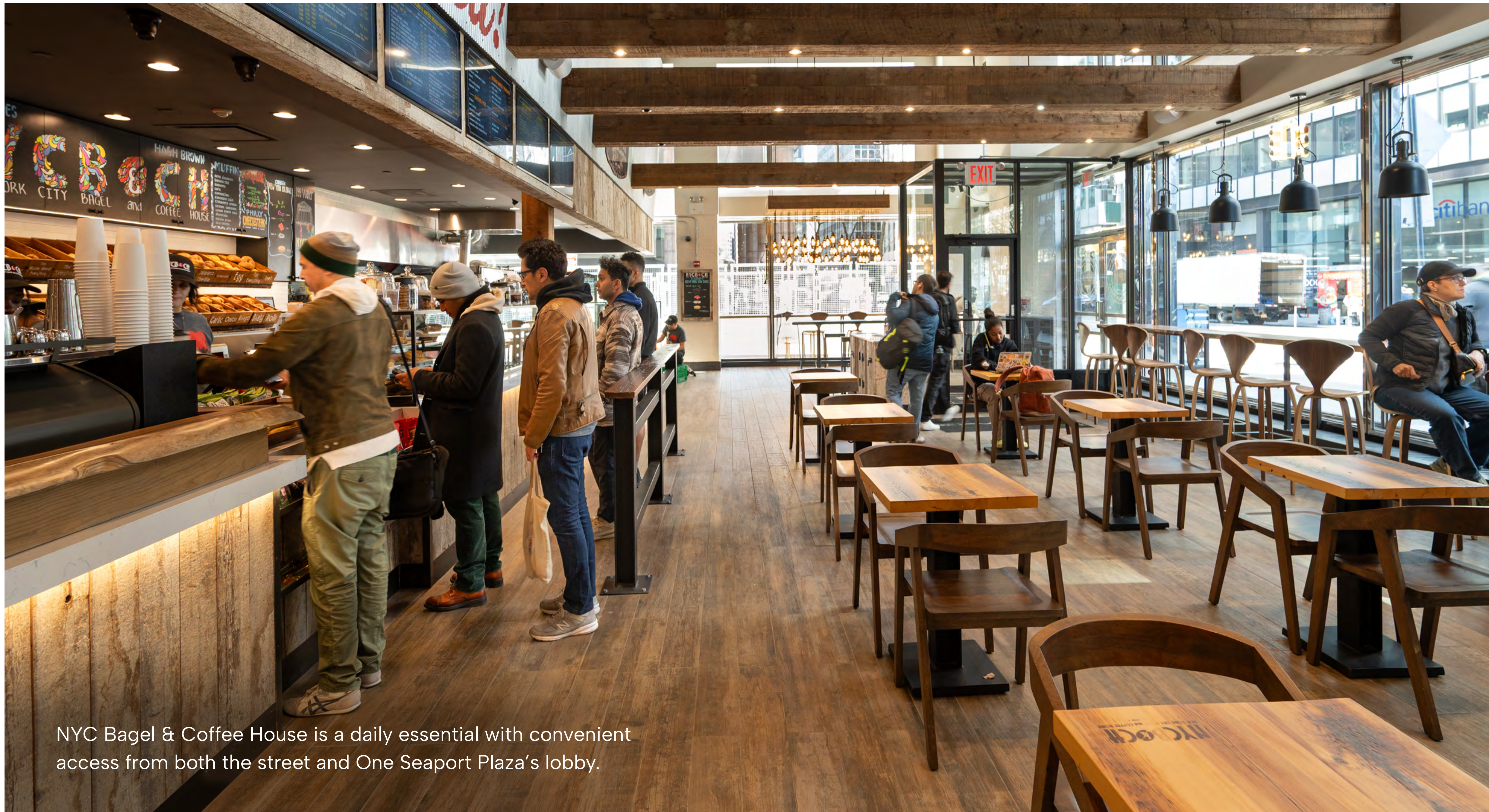
NYC Bagel & Coffee House is a daily essential with convenient access from both the street and One Seaport Plaza's lobby.